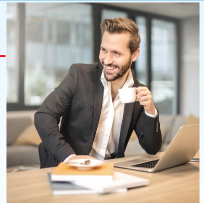
Consultant (Secondary Care)