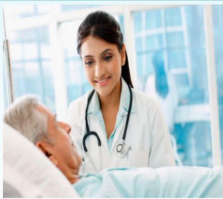
Family Doctor (Primary Care)