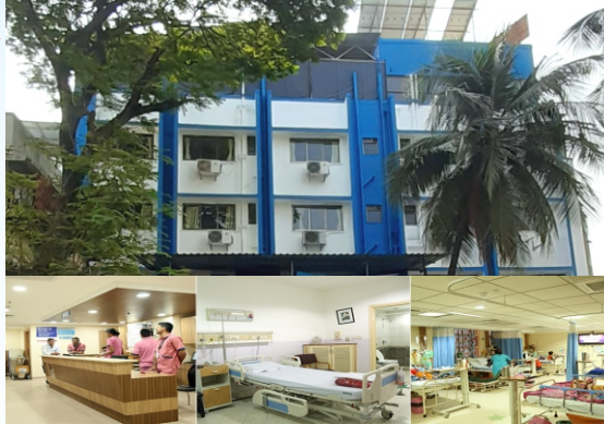
Hospital (Multi-Specialty Care)